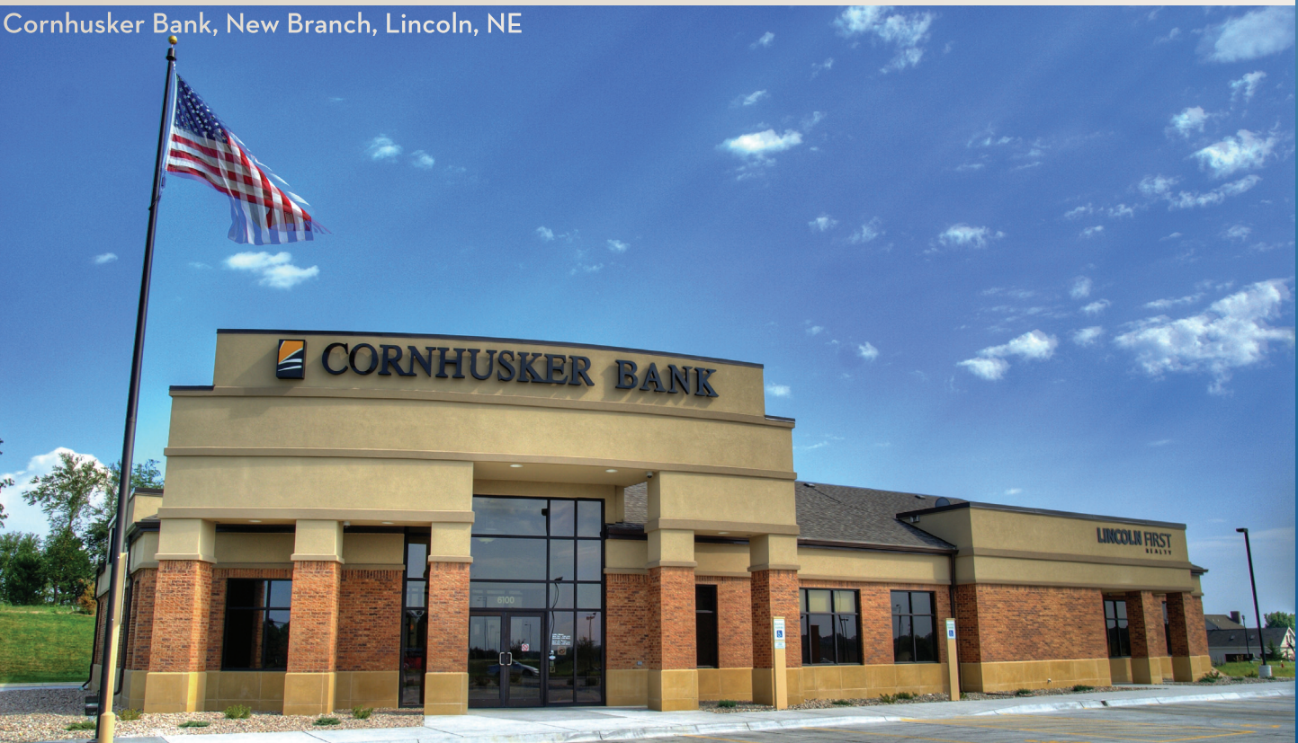
Cornhusker Bank, New Branch, Lincoln, NE

Heritage Bank New Branch, Broken Bow, NE