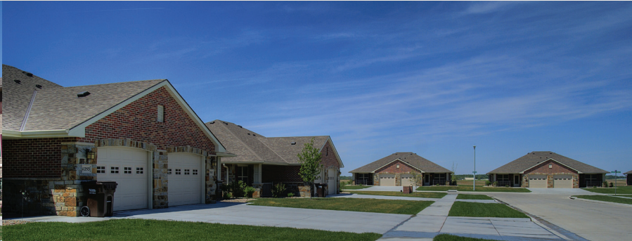
Liberty Estates, Waverly, NE