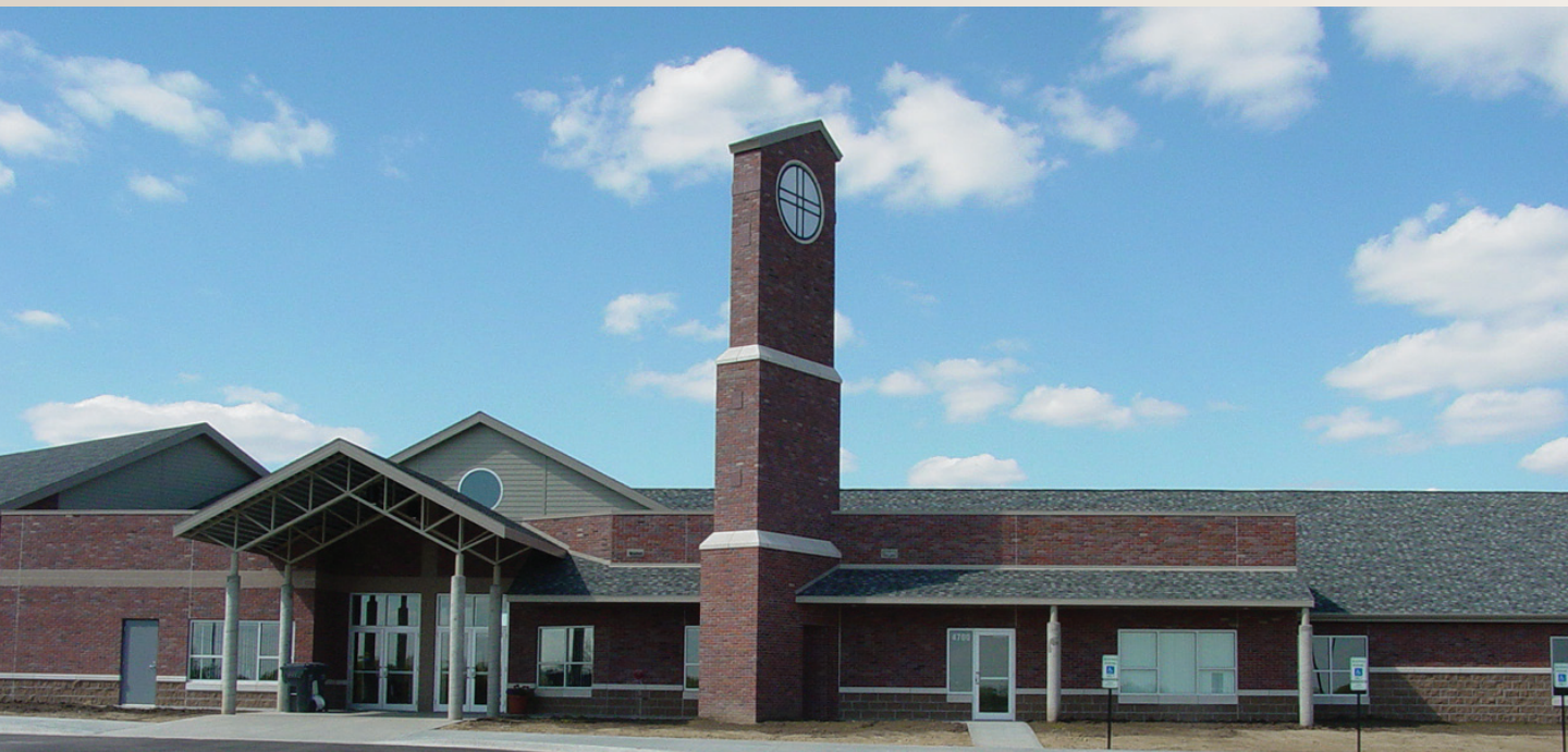
Hope Church, Lincoln, NE

Christ's Place Church New Facility, Additions and Renovations, Lincoln, NE First Mennonite Church Addition, Lincoln, NE Good Shepherd Church Additions, Lincoln, NE Hope Community Church New Facility, Lincoln, NE St. Paul Lutheran Church Addition, Arlington, NE Indian Hills Community, Lincoln, NE Good Shepherd Lutheran Church Sanctuary and Education Additions Family of Christ Lutheran Church Preliminary Design for a new Building, Kearney, NE Temple Baptist Church Renovations, Lincoln, NE Crossroads Church Addition and Remodel, Lincoln, NE Heartland Baptist Church New Facility, Norfolk, NE Northwest Church of Christ Addition, Lincoln, NE Trinity Lutheran Church Kitchen Renovation, Lincoln, NE Trinity Lutheran Church Addition, Murdock, NE Cornerstone Bible Church Addition, Crete, NE Country Bible Church Master Plan, Bennet, NE First Presbyterian Church Roof, Lincoln, NE St. James Elevator Addition, Crete, NE St. Patrick's Church Elevator Addition, McCook, NE Calvary Baptist Church New Facility, Cortland, NE Old Cheney Alliance Church, Lincoln, NE Immanuel Lutheran Church Addition, Lincoln, NE Indian Hills Community Church, Lincoln, NE: New Church Facility Auditorium and South Entry Remodel Stage Remodel Kitchen Remodel Education Addition East Office Remodel South Reception Desk Renovation Second Floor Classrooms