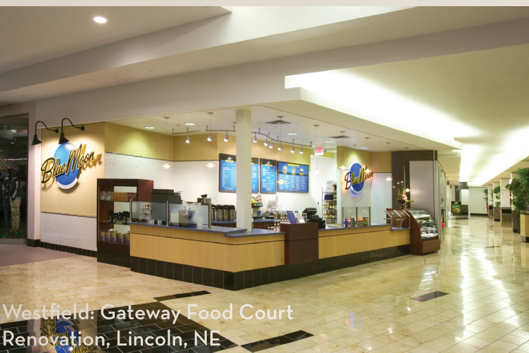
Westfield: Gateway Food Court Renovation, Lincoln, NE