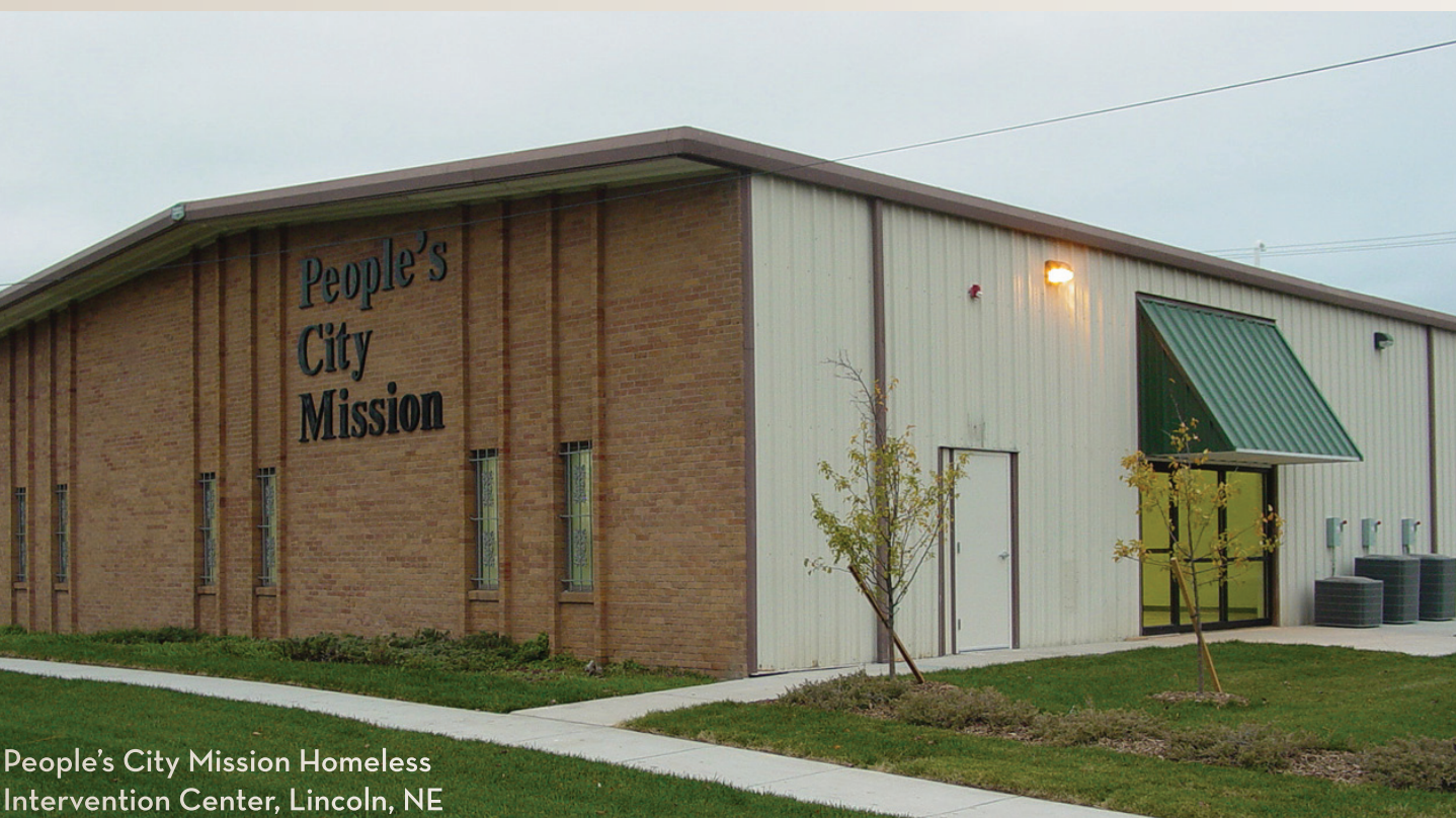
People's City Mission Homeless Intervention Center, Lincoln, NE

Bennet Post Office Exterior Renovation, Bennet, NE People's City Mission Homeless Intervention Center Remodel, Lincoln, NE Farm Services Administration Addition, Scottsbluff, NE Farm Services Administration, Eads, CO Lincoln Fire Department Station #1 Roof Replacement, Lincoln, NE Lincoln Fire Department Station #7 Site Study, Lincoln, NE Lincoln Fire Department Station #8 Garage Addition, Lincoln, NE Lincoln Fire Department Station #8 HVAC Upgrade, Lincoln, NE Lincoln Parks & Rec Office Building Expansion, Lincoln, NE Office of Disability Adjudication & Review, Springfield, MO Social Security Administration Office Building, Burlington, IA Social Security Administration Office Building, Cape Girardeau, MO Social Security Administration Office Building, Jefferson City, MO Social Security Administration Office Building, Mason City, IA Social Security Administration Office Building, Ottumwa, IA US Amateur Confederation/Roller Skating Museum, Lincoln, NE USDA Office Remodel, Wilber, NE