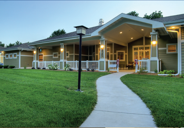
Pinnacle Specialty Care 1223 Prairie View Road, Cedar Falls, IA

Care Initiatives requested a design for a new 100-Unit facility. The new facility featured a state of the art therapy center, beauty shop, large and small dining areas, and full service kitchen.