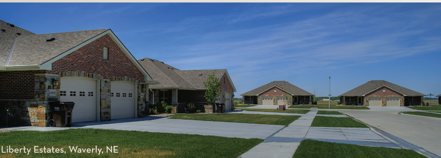
Liberty Estates, Waverly, NE

Southern Hills Specialty Care, Osceola, IA The Waterford at Wilderness Hills, Lincoln, NE