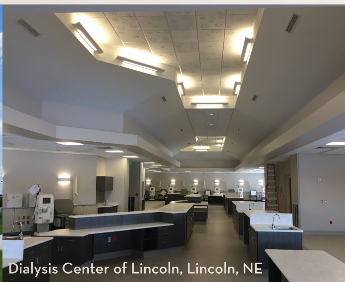
Dialysis Center of Lincoln, Lincoln, NE