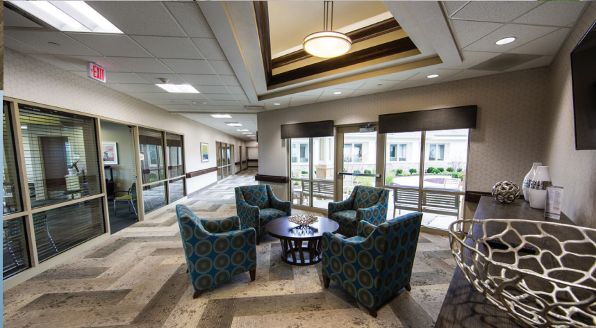
Tabitha Green House 4720 Randolph St, Lincoln, NE

Tabitha requested designs for a series of 12 bedroom assisted living houses to match the style of the existing Green House and surrounding neighborhood.