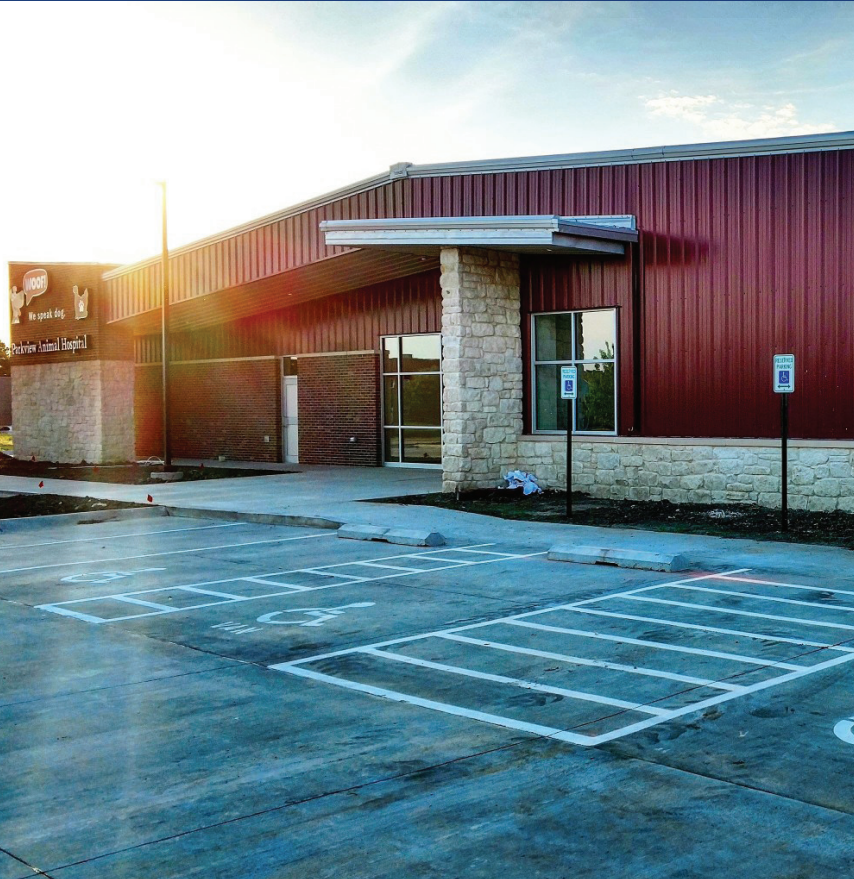
WOOF! Dog Care 1300 Infinity Ct, Lincoln, NE

Built in southwest Lincoln WOOF! serves as a comprehensive petcare center. The 15,000 square foot building boasts a wide range of services including: VIP Dog Kennels, Cat Boarding Rooms, Grooming Salons, Consultation Rooms, and an exterior Exercise Yard.