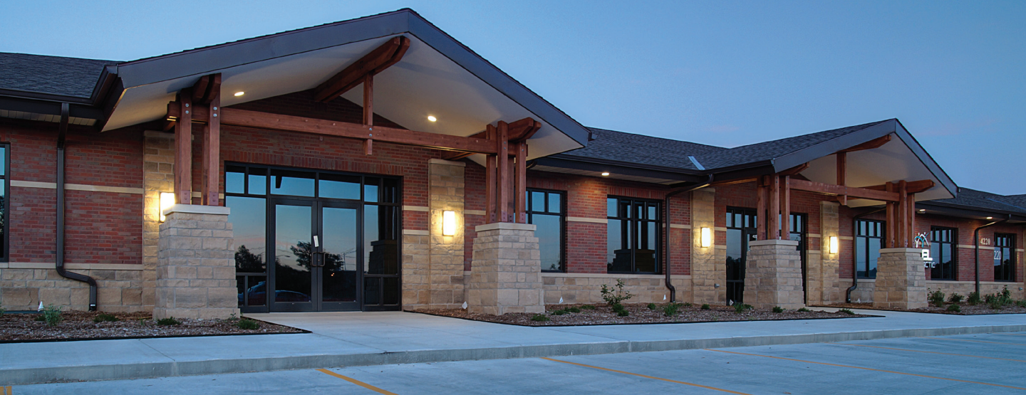
Willow Springs Office Buildings, Lincoln, NE