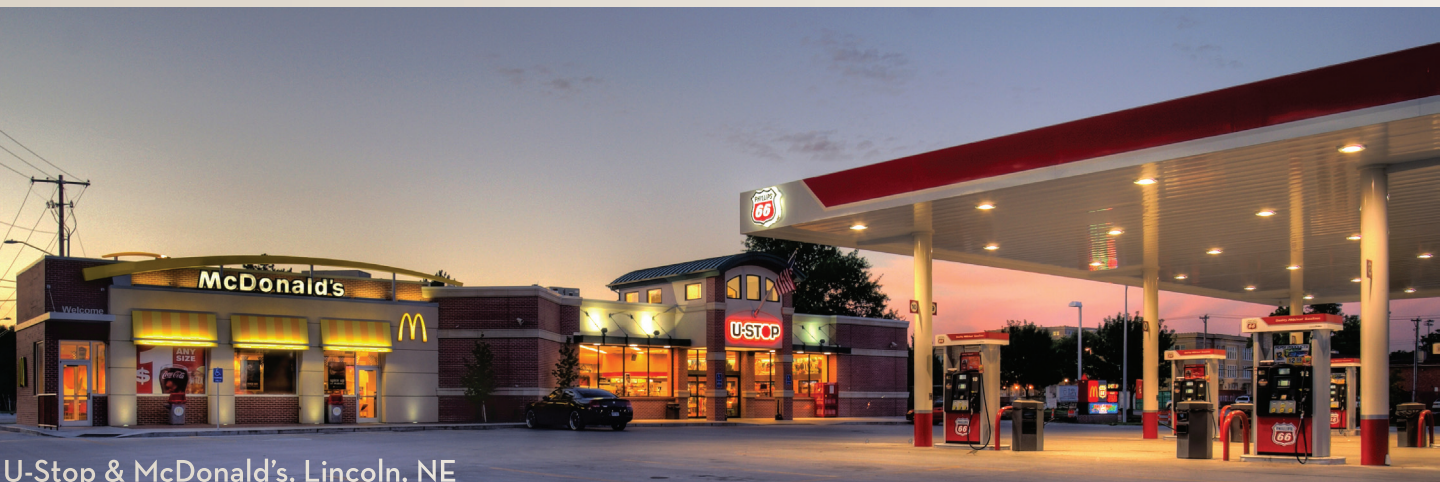
U-Stop & McDonald's, Lincoln, NE