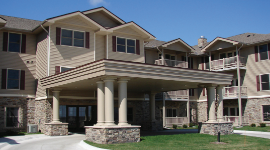
Stonecliff Estates, Lincoln, NE

Liberty Estates Townhomes, Waverly, NE Marysville Senior Housing, Marysville, KS Rosewood Estates, Alliance, NE Woodland Park Townhomes, Grand Island, NE Yorktowne Estates, York, NE CHARMED-Perkins Phases I & II, Perkins, OK Cypress Pointe, Omaha, NE Eaglecrest Retirement Community, Salina, KS Great West Townhomes, Ogallala, NE Humboldt Senior Community, Humboldt, KS James Tinsley Villas, Omaha, NE Minden West Estates, Minden, NE Parkland Townhomes, Prague, OK Riverside Lodge, Grand Island, NE Savannah Pines Retirement Community, Lincoln, NE Shannon Heights, Omaha, NE Somers Pointe, Fremont, NE South Rock Creek Estates, Shawnee, OK Stonebrook Villas, Konawa, OK The Oaks Retirement Community, Wayne, NE The Village at Heartland Park II, Seward, NE Terrace Heights Apartments, Auburn, NE West Park Townhomes, North Platte, NE Whispering Meadows, Wewoka, OK Wilderness Falls Senior Housing, Falls City, NE Willow Ridge Retirement Community, McCook, NE Eaglecrest Retirement Community, Salina, KS