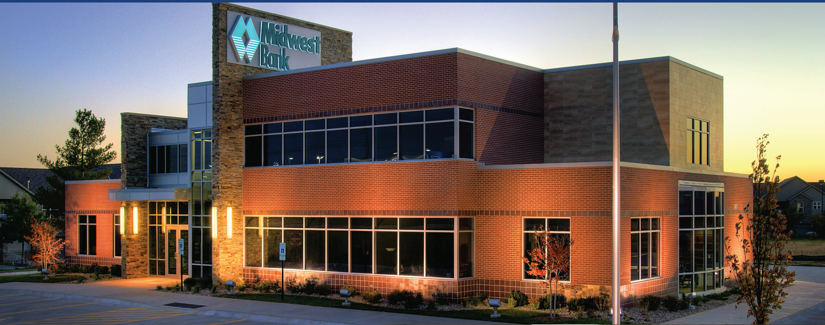
Midwest Bank 2655 Jamie Ln, Lincoln, NE

Through the use of different combination of stone, brick and tile both inside and out, as well as altering the shape of the building with an additional floor, ADA design the building to project its own identity while still being recognizable as a Midwest bank branch.