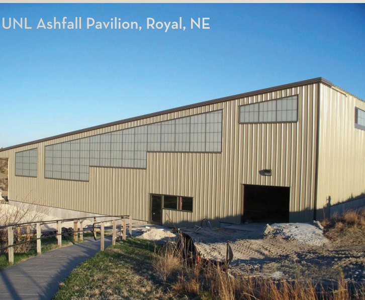
UNL Ashfall Pavilion, Royal, NE

Raymond Rural Fire Station, Raymond, NE Boosalis Park Indoor Shooting Range, Lincoln, NE Linweld, Lincoln, NE and Red Oak, IA Ameritas Hanger Mezzanine, Lincoln, NE Athey Painting New Shell Building, Lincoln, NE Benchmark Biolabs Metal Building Brainard, NE Brester Construction Corporate Office and Warehouse, Lincoln, NE Cameron Homes Warehouse, Lincoln, NE Capitol City Storage, Lincoln, NE East O Storage, Lincoln NE FedEx Facility Expansion, Grand Island, NE Floors Inc. Warehouse, Omaha, NE General Excavating Mini Storage, Lincoln, NE General Excavating Warehouse, Lincoln, NE Gretna Fire Station, Gretna, NE H & H Self Storage 4 New Buildings, Hickman, NE HDS Warehouse 1 & 2, Lincoln, NE Isco, Lincoln, NE Kush Furniture, Omaha, NE Lincoln Airport Authority Hangar, Lincoln, NE Lynnco, Lincoln, NE Midlands Packaging, Lincoln, NE Omaha Public Power District 6 Bay Garage, Fort Calhoun, NE Papillion Sanitation Service, Papillion, NE St. Elizabeth's Portable Cath Lab, Lincoln, NE Sutherland's, Lincoln, NE University of Nebraska-Lincoln Agriculture Research and Development Center New Facility, Mead, NE US Properties 168,000 SF Warehouse, Lincoln, NE York Adopt-A-Pet, York, NE