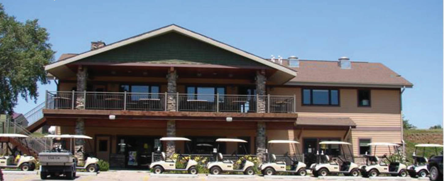
Hidden Valley Golf Course Club House, Lincoln, NE

Abbott Sports Complex, Lincoln, NE – Multiple Projects Ashland Country Club Addition, Ashland, NE Girl Scouts Lakeview Cabin, Lake Maloney, North Platte, NE Nebraska Tennis Center, Lincoln, NE Bison Sports Complex, Lincoln, NE Capital Indoor Sports Addition, Lincoln, NE Den Hartog Baseball Complex Storage Building, Lincoln, NE Lincoln Christian School Sports Complex & Tennis Courts Study, Lincoln, NE Pitch 2 Indoor Soccer Thunder Sports, Lincoln, NE Play It Again Sports, Lincoln, NE Rock Solid Gymnastics, Lincoln, NE Seacrest Field Concessions & Restrooms, Lincoln, NE Seacrest Field Sound & Lighting Project, Lincoln, NE Sherman Field Baseball Complex, Lincoln, NE Thunder Sports Complex Remodel, Lincoln, NE York Country Club Addition, York, NE