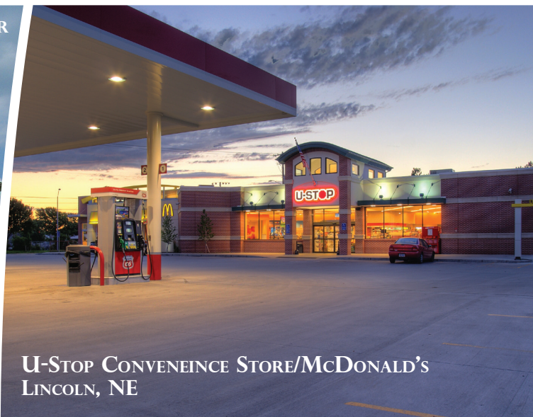
U-STOP CONVEINENCE STORE/McDONALD'S LINCOLN, NE