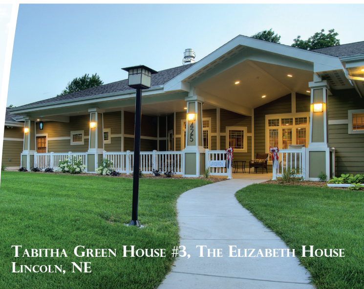
TABITHA GREEN HOUSE #3, THE ELIZABETH HOUSE LINCOLN, NE