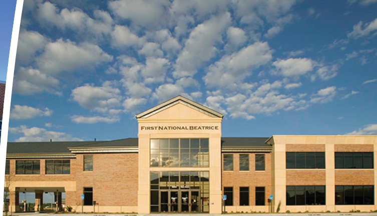
FIRST NATIONAL BEATRICE BANK AND TRUST LINCOLN, NE