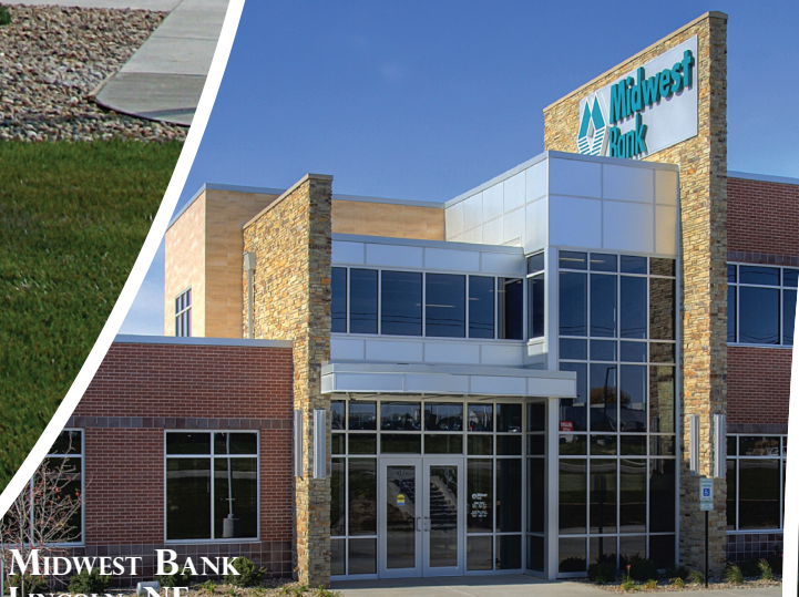
MIDWEST BANK LINCOLN, NE