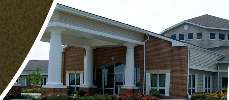
NORTHERN MAHASKA NURSING REHAB CENTER OSKALOOSA, IA