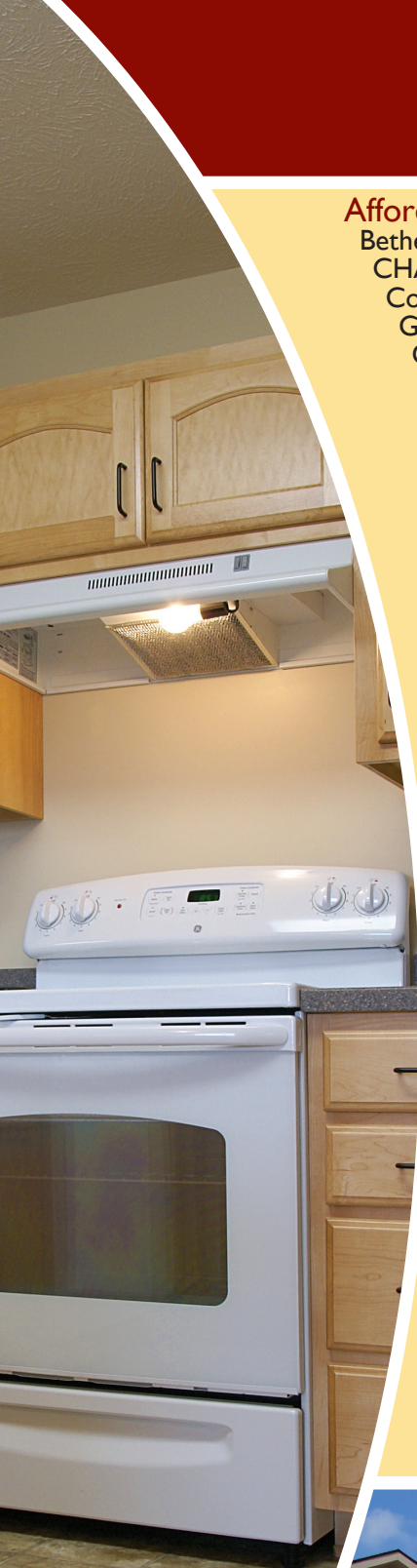
STONECLIFF ESTATES LINCOLN, NE

Alpha Omega House for Indian Hills Community Church, Lincoln, NE Auburn Apartments, Auburn, NE Claremont Apartments, Lincoln, NE Eaglecrest Retirement Community, Salina, KS Embassy Park Apartments, Lincoln, NE Hoegemeyer-Palmer Apartments, Lincoln, NE