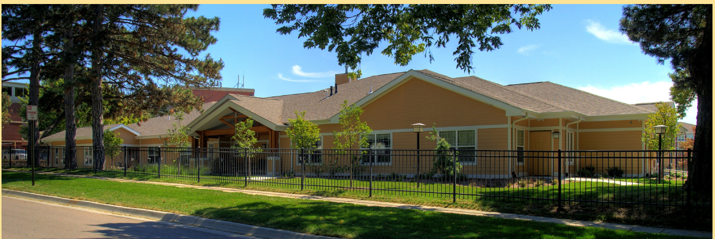
THE JOURNEY HOUSE AT TABITHA, LINCOLN, NE

The Journey House at Tabitha, Lincoln, NE The Waterford at Wilderness Hills, Lincoln, NE Southern Hills Specialty Care, Osceola, IA