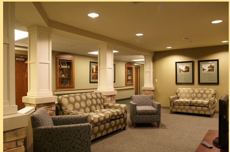
WILLOW BROOK ASSISTED LIVING, YORK, NE

Avoca Assisted Living Addition, Avoca, IA Haven Manor, Multiple Facilities, Lincoln, NE Heartland Park Assisted Living Renovation, Seward, NE Regency Care Center 30-Unit Assisted Living Addition, Norwalk, IA Regency Square Assisted Living Addition and Remodel, South Sioux City, NE The Waterford Assisted Living, Lincoln, NE Victory Hills Assisted Living Renovation, Kansas City, KS Willow Brook Assisted Living, York, NE