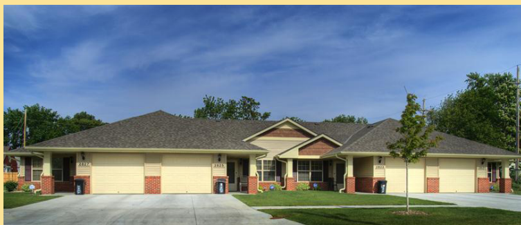
SHANNON HEIGHTS, OMAHA, NE

Eaglecrest Retirement Community, Salina, KS Savannah Pines Retirement Community, Lincoln, NE Stonecliff Estates, Lincoln, NE The Oaks Retirement Community, Wayne, NE Willow Ridge Retirement Community, McCook, NE